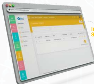
Inquiry List Screen